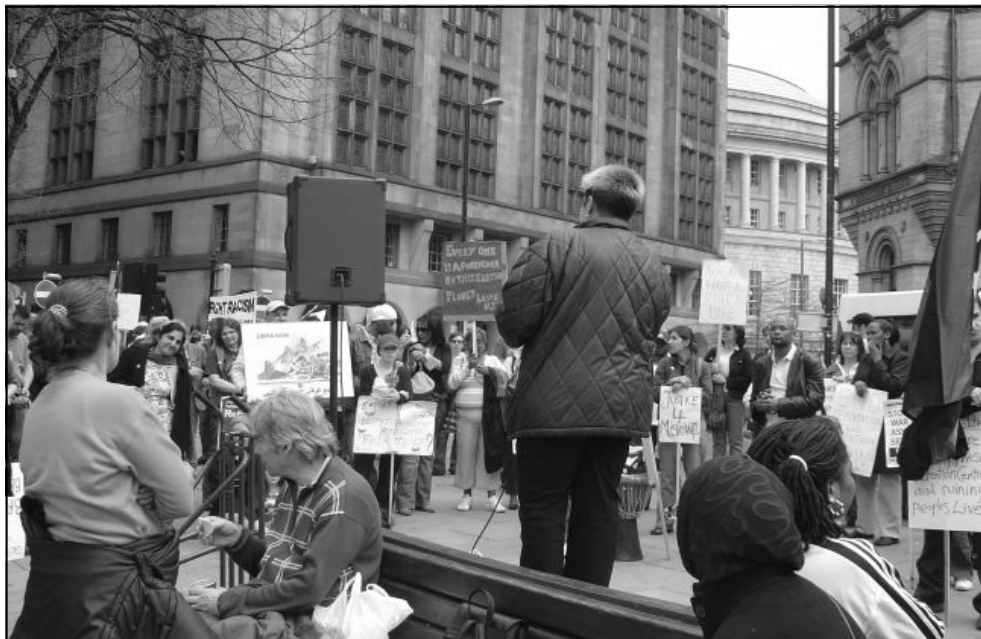
NCADC Demo in Manchester, 15th April 2006