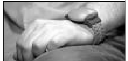
a wrist tag

Section 36 of the Immigration and Asylum (Treatment of Claimants) Act of 2004 allows for the electronic monitoring of those liable to detention under the Immigration Acts. This includes asylum seekers, illegal entrants, those found working in breach of their conditions of stay, those who have overstayed, people subject to further examination at a port of entry, and those refused leave to enter. (Home Office)