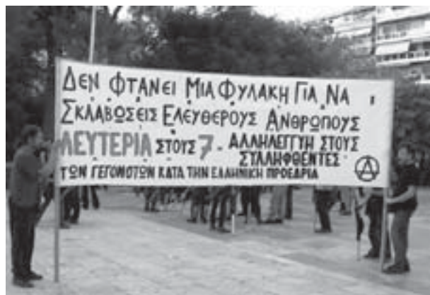
A solidarity demonstration in Greece

In the face of all this injustice they have started a hunger strike to demand their