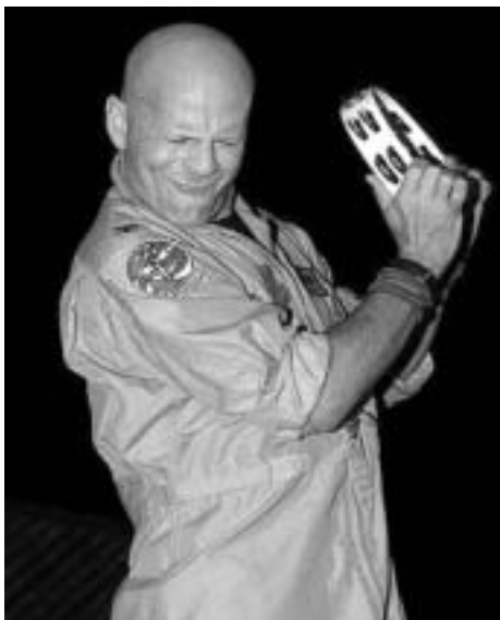
Willis and his tambourine

AND THE WINNER of this month's nomination for celebrity prat of the month is none other than Bruce Willis, star of the Die Hard films and the Sixth Sense. He takes this prestigious award for "doing his bit" for those good ol' US troops in the Iraqi desert. Performing with his band, in a US Air Force flight suit, Brucey offered a one million dollar award for the capture of Saddam Hussein.