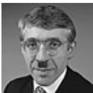
Jack Straw before he shaved his toothbrush moustache off

H ome secretary Jack Straw has proved himself to be even more of a tosser than previously suspected. His new plans to lock away innocent mentally ill people on the word of an "expert" shows he can sink to even lower depths.