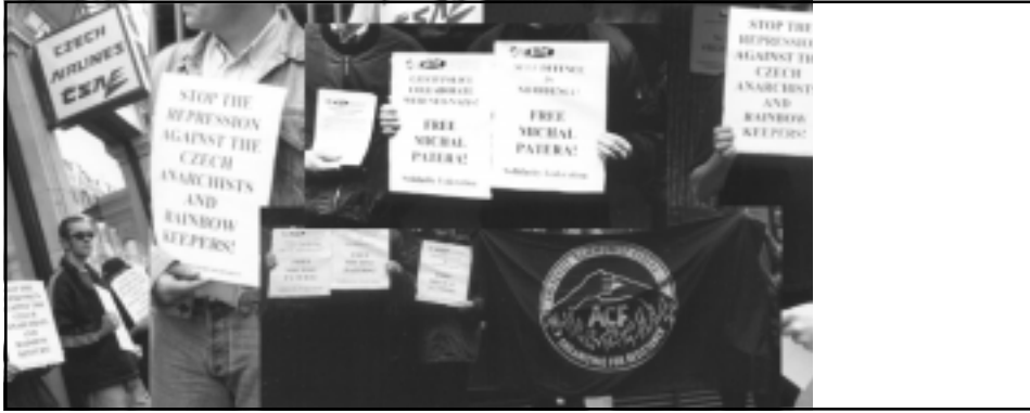
The ACF and Solidarity Federation picketing in support of Czech anarchists

T he Federation of Social Anarchists (the Czech section of the anarcho-syndicalist International Workers Association) is calling for international support after one of its members was charged with murder in relation to an incident last November.