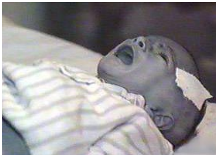
Well over a million Iraqis have died because of sanctions since the Gulf War ended

T he world policeman the USA and its faithful little special constable Britain are continuing to wage war on Iraq. This is not a spectacular "over in few days" war like the previous Gulf War. This is one of low level (but tell that to murdered Iraqi civilians and their families) attacks on Iraqi military installations, and the remorseless murder of sanctions. But once again, the purpose is not to overthrow the murderous Saddam regime, but to keep it in check, and make sure Saddam knows his place.