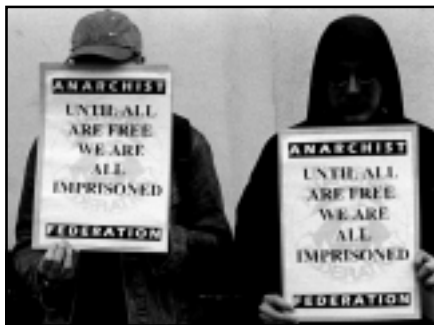
Two AFers outside Pentonville prison

We in the AF think that only a movement based in working class communities and workplaces can have revolutionary potential, but at the same time see a place for large gatherings of people who want to get together to feel safety in numbers, unity and meet other revolutionaries. The last 3 Maydays have been the most eventful for years and have made International Workers Day a notable