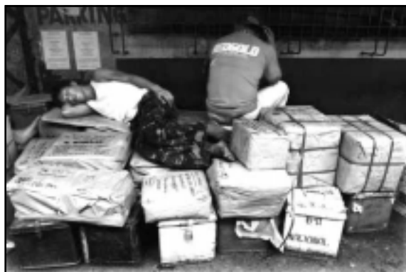
Voter apathy or the best use for ballot boxes?