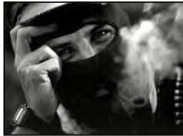
Marcos: Lefty politician

The deal with Fox calls for "autonomy" for indigenous groups with clear electoral constituencies for them. Funny though, but Mexico's constitution already has the most "progressive" promises to workers and peasants,