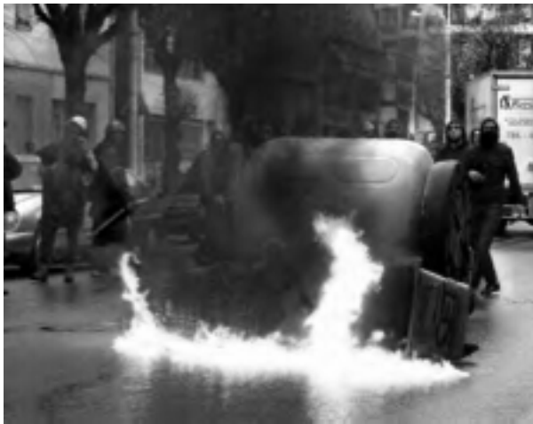
More gratuitous rioting pictures

On the 6th of December the latest fashion for disrupting meetings of the rich and powerful (as seen in Birmingham, London, Seattle, Prague, etc.) was extended to include European Union summits. Around 70 000 people gathered in the French town of Nice, the day before the opening of the summit. The majority of these people were trades unionists, with smaller numbers of anarchists and leftists also present. A short and dull official march took place, most trades unionists seemed happy that their symbolic demands for greater reforms had been heard, though thousand of activists had more radical plans... 1 500 Italians that had tried to get to Nice by train were blocked at the border, which lead to thousands of demonstrators to occupy Nice railway station after the official march and demand the border was opened. The riot police reacted by attacking the demonstrators throwing them out of the station. Sporadic scuffles then took place in the centre of the city. On December 7th around 5-6 000 formed various groups to hassle the participants of