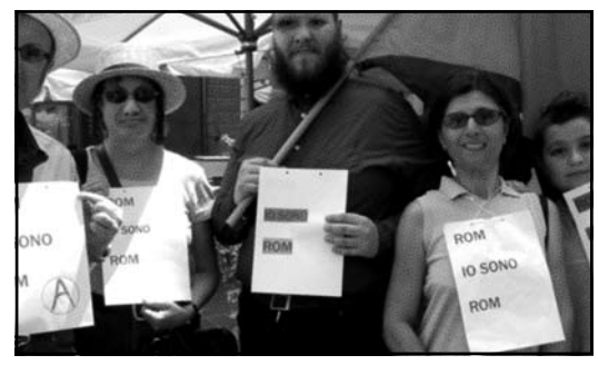
Anarchists declare their solidarity with local Roma attending the recent congress of the International of Anarchist Federations in Carrara, northern Italy

But the Roma are self-organised and defend