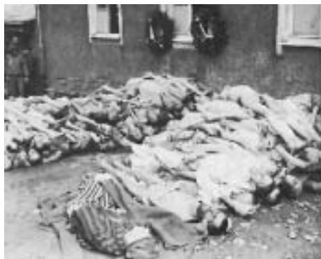
Fascism doesn't begin with the gas chambers, but that's where it ends.

Who is responsible for this rapid and widespread growth of racism? Blame firmly rests with Labour. The local Party was complacent and corrupt. But it was under Blair that mass racism in the borough was cre-