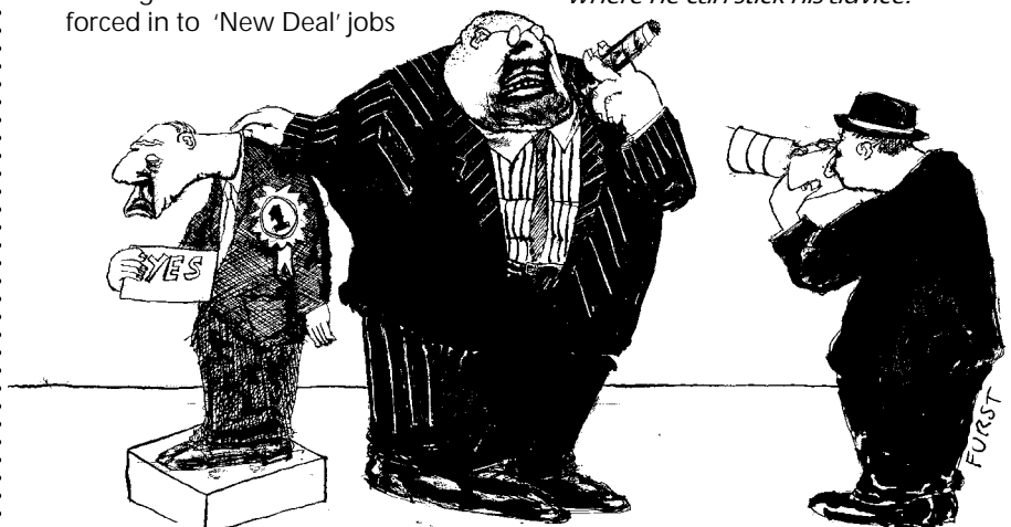
A flexible workforce - top breeders recommend it!