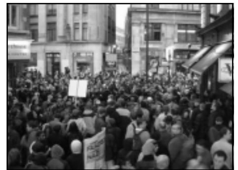
Mayday in Mayfair

Meanwhile, the Trotskyists of the SWP, through their front organisation Globalise Resistance (surely that's Demobilise Resistance?) had entered into an alliance with trade union bureaucrats and Stalinists for yet another boring demonstration marching from A to B. The most recent Maydays, for all their faults, were an attempt to get away from