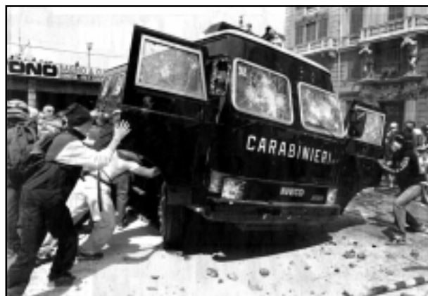
"Anyone seen the van guard?"

These guardian angels of Democracy are the very same: Destroyers of Hiroshima and Nagasaki. Profiteers from Auschwitz, Treblinka, Buchenwald, Mauthausen... Developers of Napalm, Agent Orange and carpet-bombing. Apologists for death in