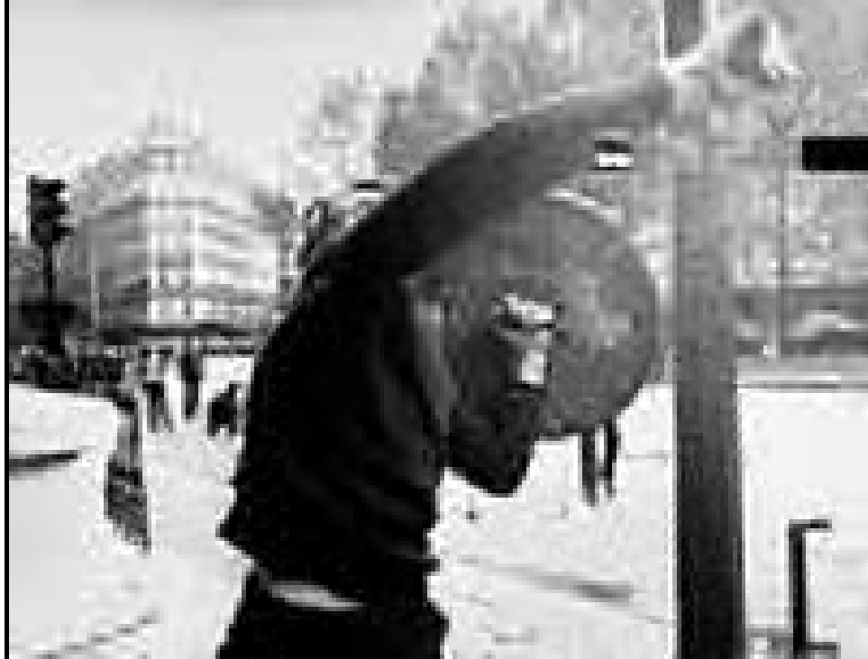
FRENCH STUDENTS FROM '68 COULD TEACH TODAY'S GENERATION A THING OR TWO

ccording to popular belief, everybody hates students, with the possible exception of brewers. Spoilt, lazy middle class brats sponging off the taxpayer and forever whinging about how skint they are. Selfish, arrogant idiots having a three year binge at public expense before sliding neatly into a highly paid job somewhere bossing the rest of the world about.