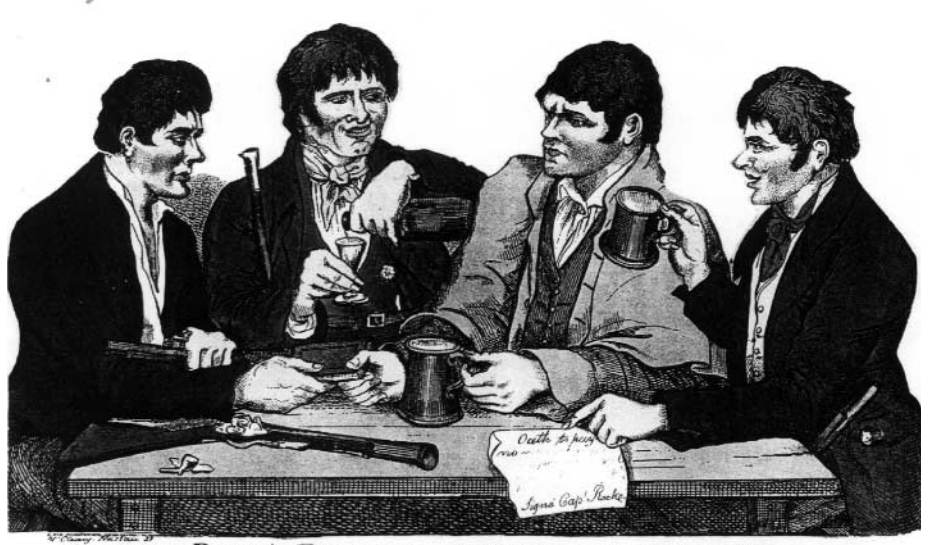
CAPTAIN ROCK'S BANDITTI SWEARINGIN A NEW MEMBER

In the 1750s, the growing market demand for pastoral products led to an expansion of dairy farming and grazing (which required the enclosure of common lands). As agriculture became more profitable, land values rose, and so did the price of conacre (the small plots on which the bulk of the population depended). The rural poor faced ruin. Beginning in Tipperary, a county which was a fertile producer of agrarian unrest, and then expanding into east Munster and south Leinster, the Whiteboy